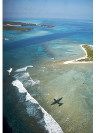
REMOTE RESERVE A Coast Guard plane over Midway