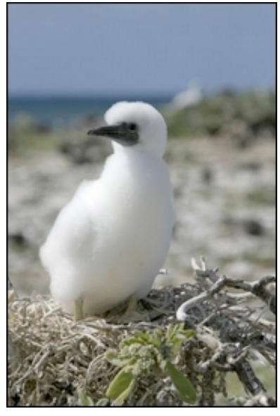
An immature red-footed booby waits in its nest for its next meal.