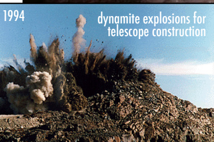
1994 dynamite explosions for telescope construction

Industrial park desecrates wahi pana, degrades conservation lands